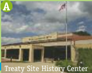
Treaty Site History Center