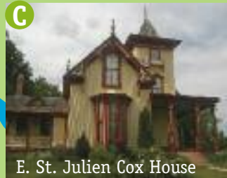
E. St. Julien Cox House