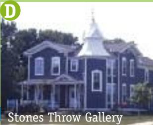
Stones Throw Gallery