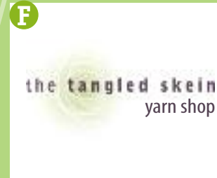
the tangled skein yarn shop