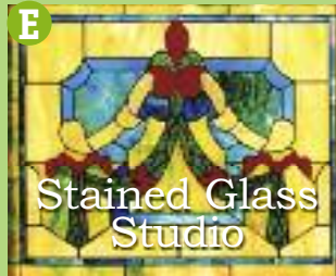
Stained Glass Studio